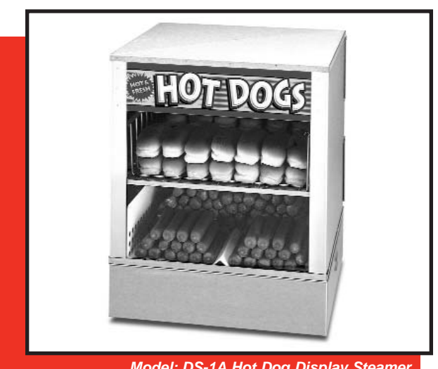
Model: DS-1A Hot Dog Display Steamer